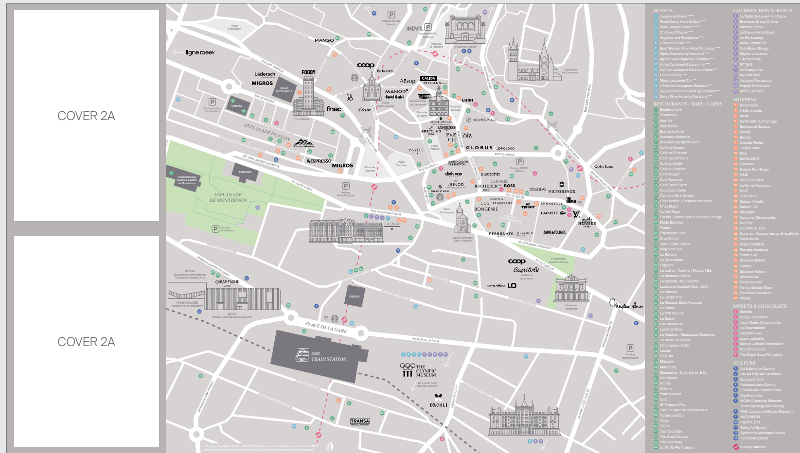
Non contractual visual